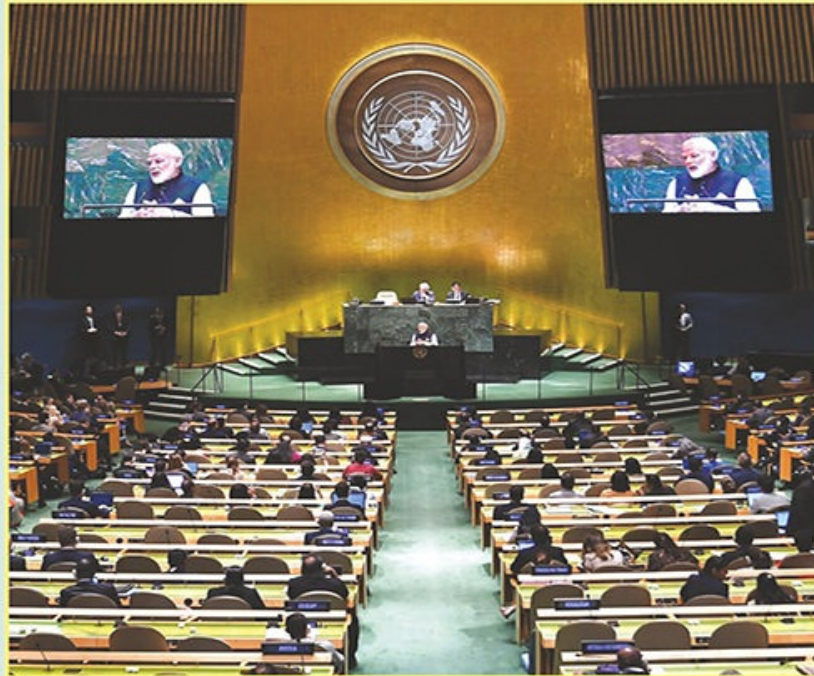
Prime Minister Shri Narendra Modi addressing the 74th session of the United Nations General Assembly (UNGA), in New York, USA on September 27, 2019