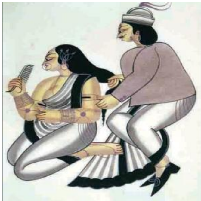
Plate 2.8, Kali Ghat Patua Artists Painting, Retrieved from URL: http://www.sunday-guardian.com/artbeat/patua-art-comments-on-babu-culture