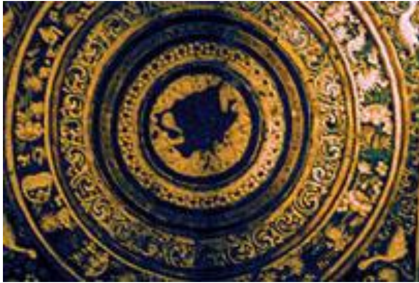
Plate 2.3 Mural Painting, Design on the Ceiling, Ajanta caves, Maharashtra.