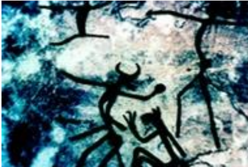
Plate 2.1 Wall painting of a dancer, Bhimbetka, Madhya Pradesh.