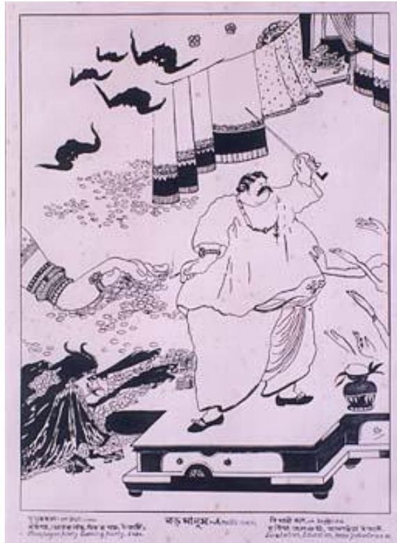
Plate 2.11, Satirical Drawing, Gaganendranath Tagore