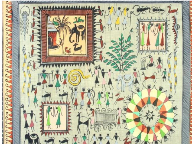
Plate 2.9, 'A BRIGHT DAY', Odisha Pata Painting, Retrieved from URL: http://www.rareindianart.com/resx.php?id=383&s=x1&n=right