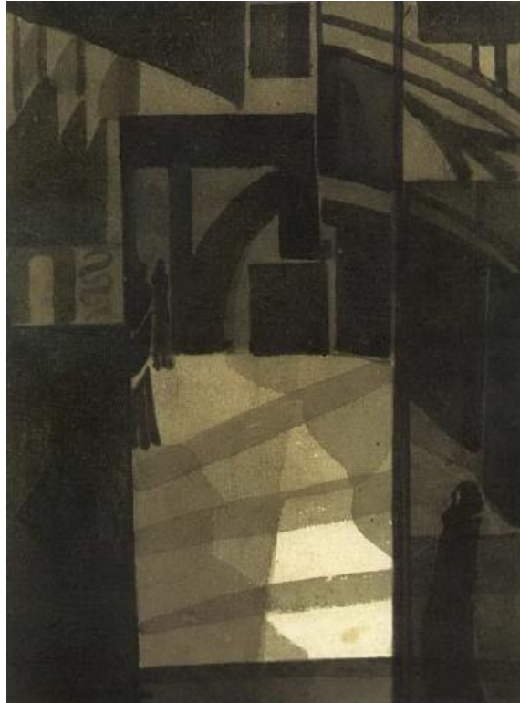
Plate 2.12, The Atrium, 1920, Gaganendranath Tagore, Retrieved from URL: http://artsalesindex.artinfo.com/asi/lots/2578490