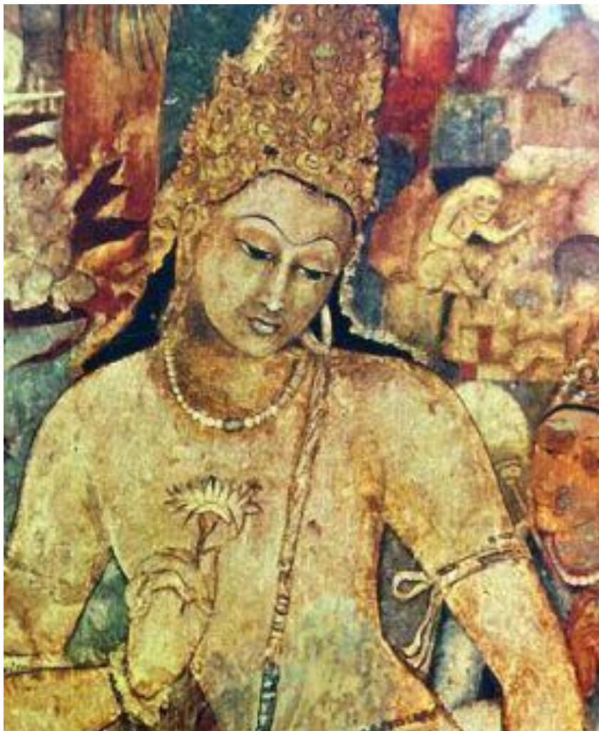
Plate 2.2 Mural Painting, Ajanta cave, Maharashtra.