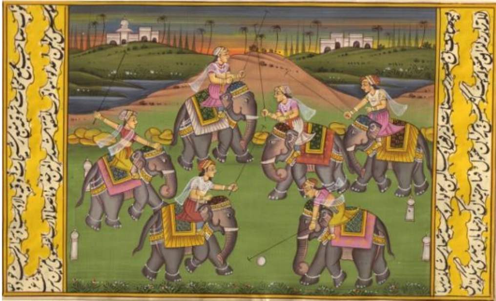
Plate 2.5, Mughal Miniature Painting.