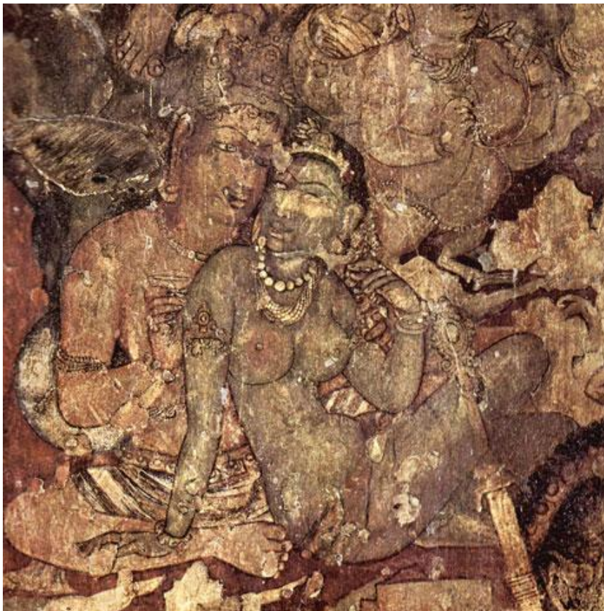
Plate 2.4 Mural Painting, Ellora cave, Maharashtra.