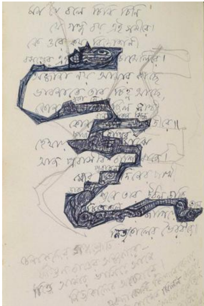
Plate 2.10, Doodles Rabindranath Tagore, Retrieved from URL: http://www.thehindu.com/