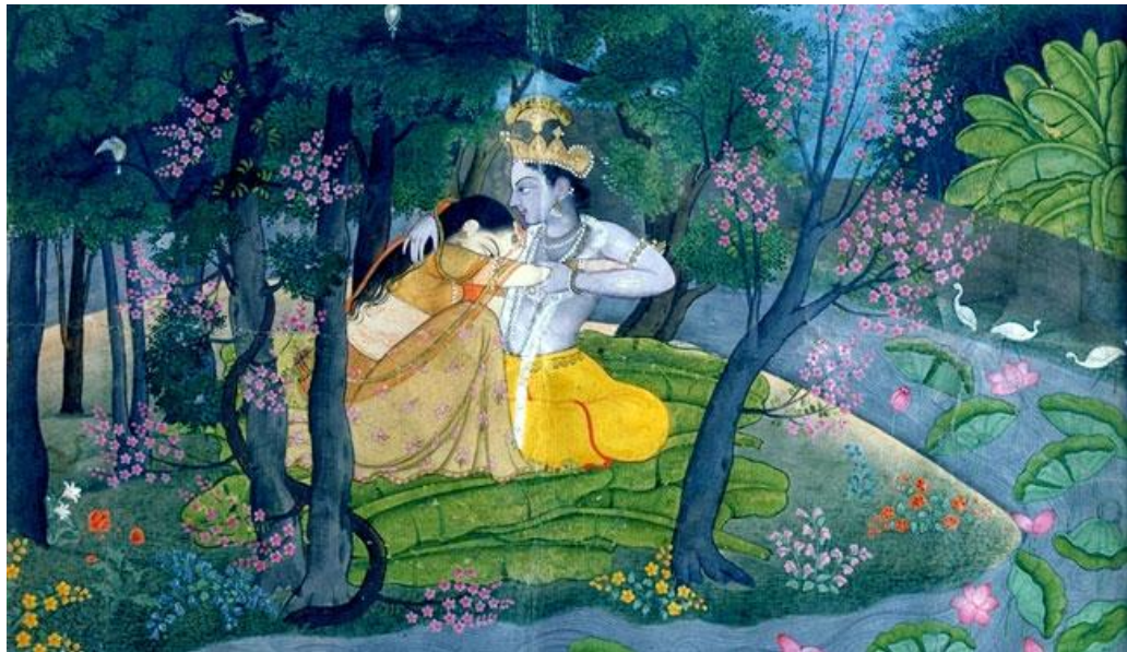
Plate 2.6, Raj Put Miniature Painting, Retrieved from URL: resources.archedu.org